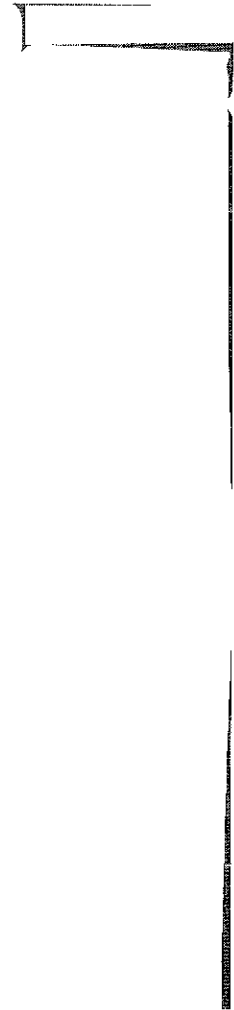
Figure B.1 : Map of the Project