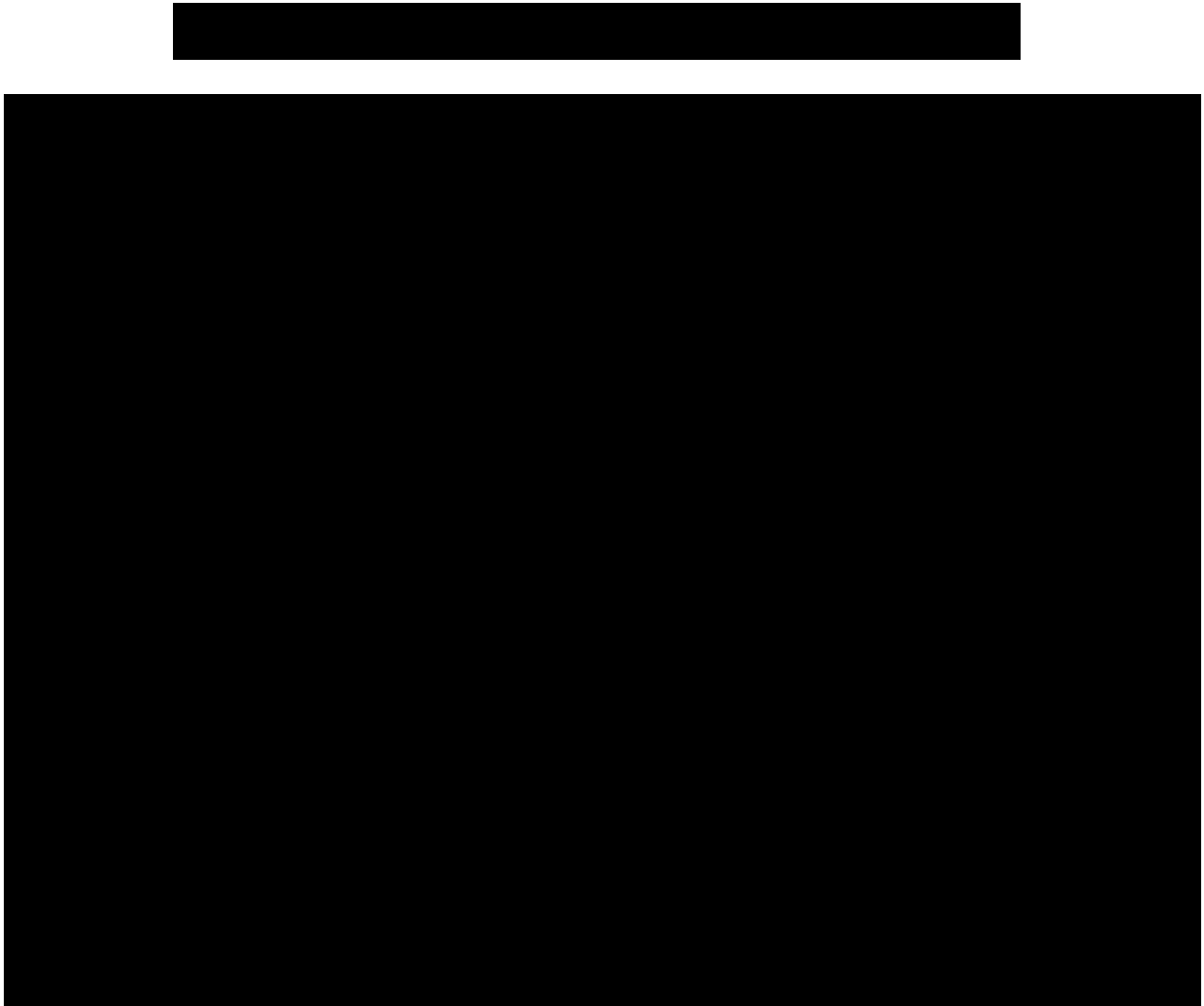
Figure A.1: Generating Facility One-Line Diagram