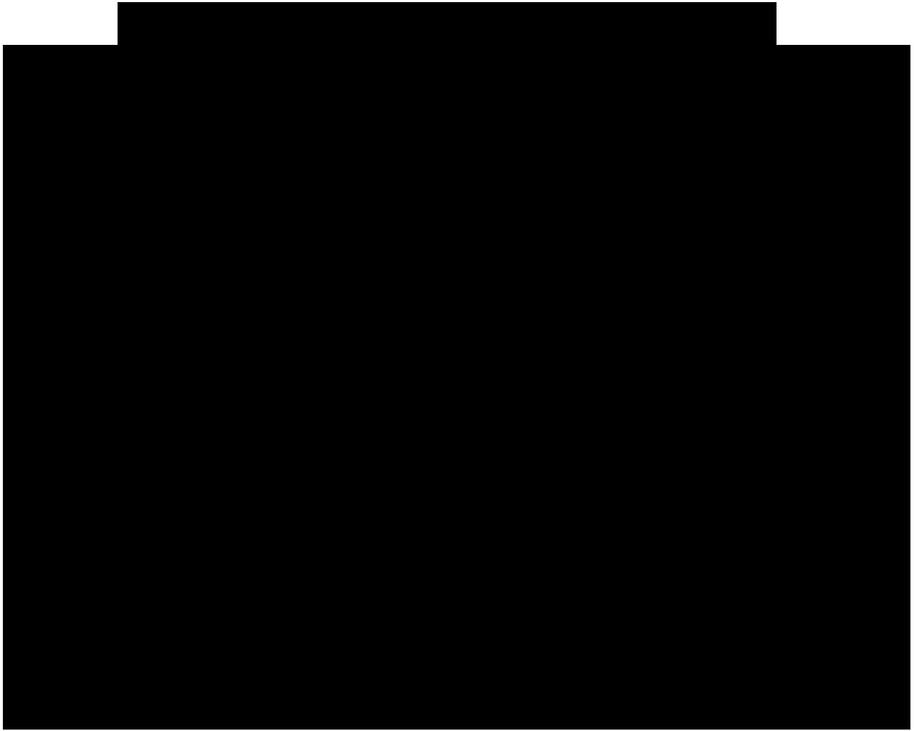
Figure A.1: Generating Facility One-Line Diagram