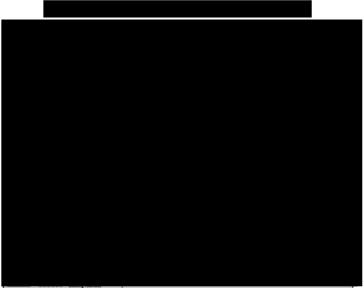
Figure A.1: Generating Facility One-Line Diagram