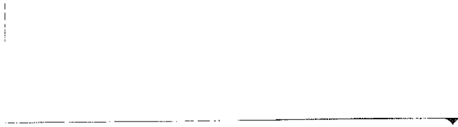
Figure B 1: Man of the Project