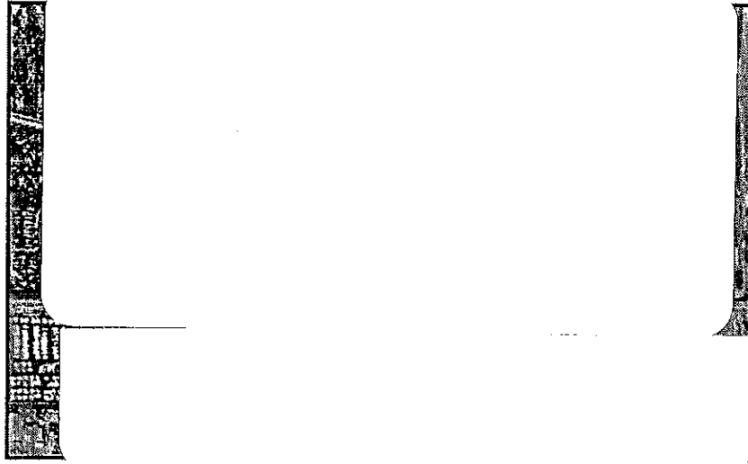
Figure 2-2: Proposed Single Line Diagram