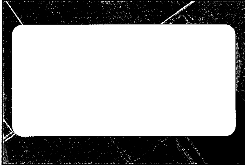
Figure 2-2: Proposed Single Line Diagram